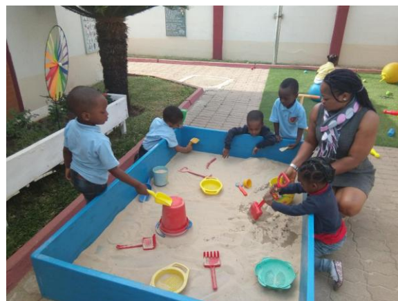
We learn through play in a fun and relaxed atmosphere.