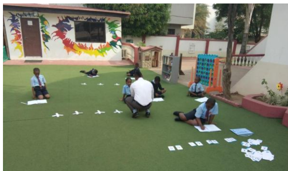
Maths is learnt easier with visuals and resources that make it “real” and “applicable”