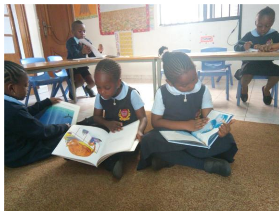
We love to get lost inside a good book, it takes us on a magical adventure.