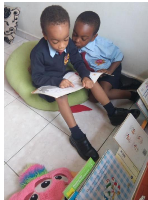
Sharing a book with a friend makes it twice as much fun.