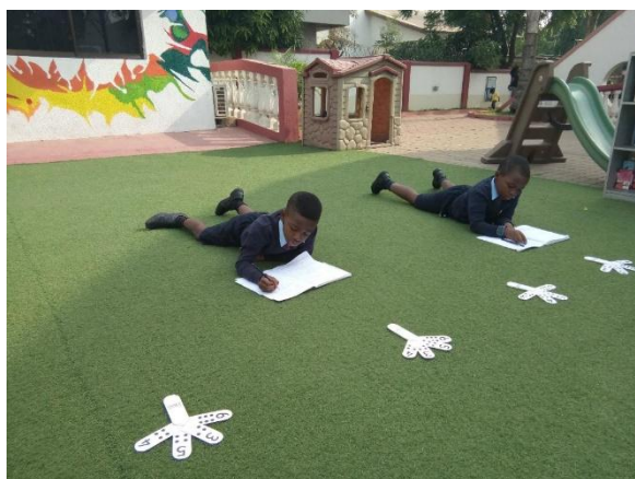
Maths out-door lesson

Please find some photographs from school this week around play time, teaching and learning.