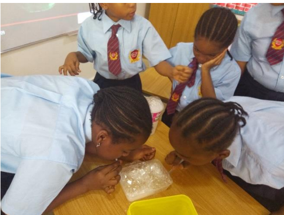
Detergent, water and air.