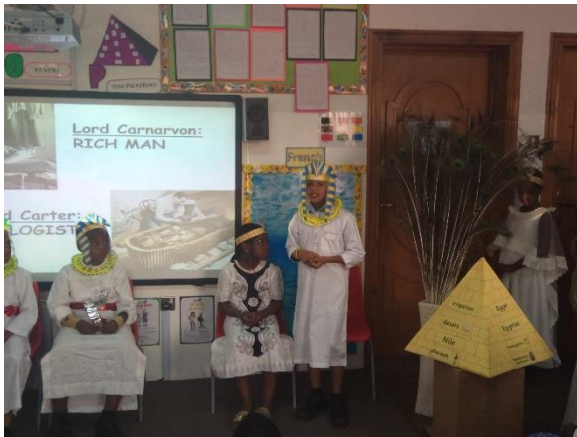
Exciting journey all the way back to the time of the pyramids and the Pharaohs.