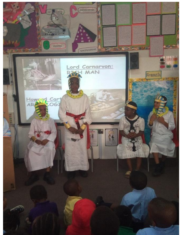
Archaeologists dig up the ground to find ancient remains to piece History together