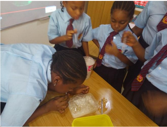
Everyday materials are used to clarify and enforce learning