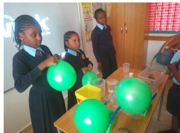
Hands on learning is excellent