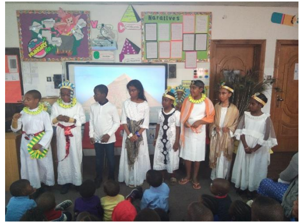
Year 4 class assembly, focus on Ancient Egypt