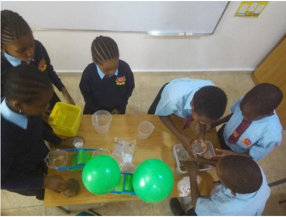
We learn how to work together in small groups.