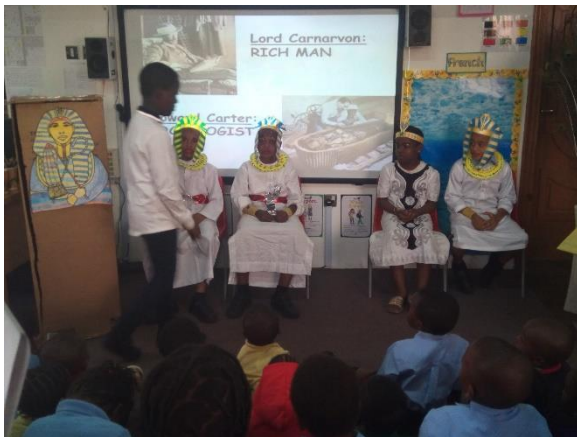
Well done to all the Year 4 pupils