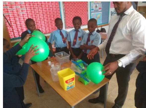
Science experiment in Year 5, solids, liquids and gases.

Our photo gallery this week shows the Year 5 pupils working with clay to create a human bust and their ever so interactive science lessons. Also, beautiful photographs from the Year 4 class assembly on ancient Egypt.