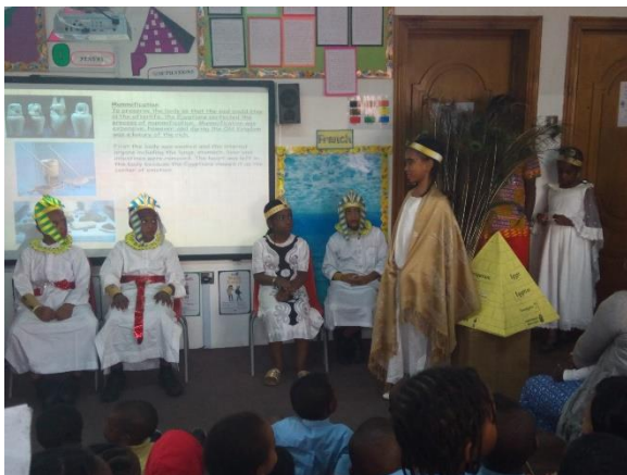
More from the Year 4 assembly

We wish all pupils and parents a fantastic and restful weekend.